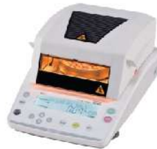
Moisture Analyzer Model : MOC63u Shimadzu Japan