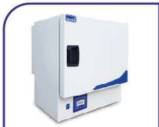
Drying Oven/Incubator (Dual-Use) Model : ED-53