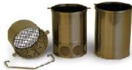
Joisel apparatus Model : c211