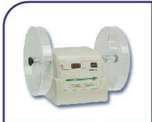
Dual Drum Friability Tester Model: WT 111, 902, 903