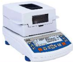
Moisture Analyzer Model : MA 110, R. WH RADWAG Poland