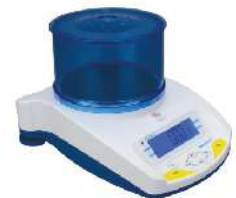
Highland Model : HCB 302, HCB 602H, HCB 6001