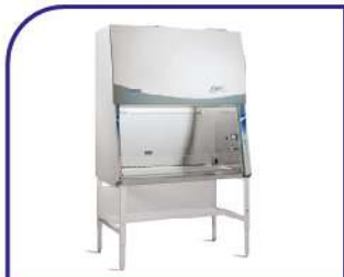
Biosafety Cabinet Model : BSC 1300Iia2BOV-D50 To BOV-D240