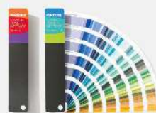
Color Guide (TPG) Model : As Per Sample