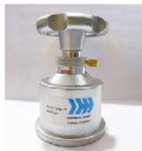
Mini- GSM-Cutter - Small Model : James Heal