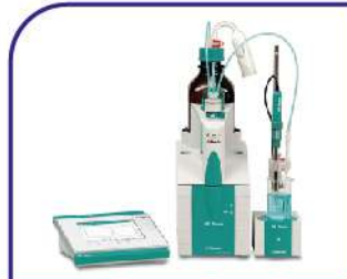
Automatic Karl Fischer Titrator Model : 888 Titrando