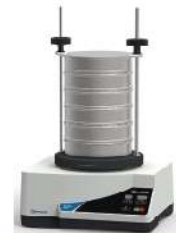
Laboratory test Sieve Shaker Model : As per Sample