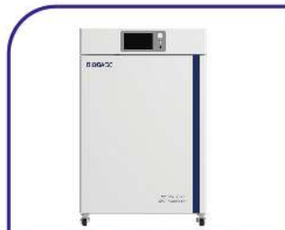
Biobase CO-Incubator Model : Bjpx-C80