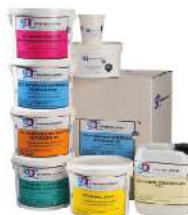
AATCC Detergent Model : As per Sample