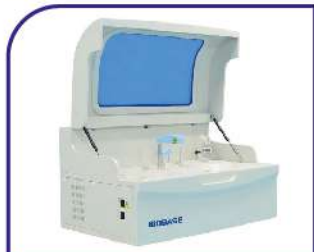
Fully Auto Biochemistry Model : BK200