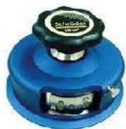
GSM Circular Cutter Model: Schroder GSM200