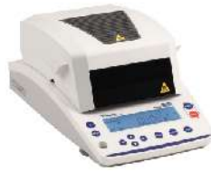
Moisture Analyzer Model : DBS 60-3 Kern Germany