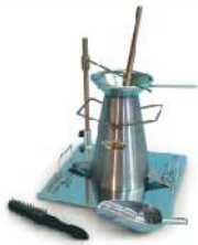
Cone Filling Funnel Model : C180 BOV-D30, BOV-D50 TO