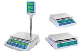
Azextra Retail Scales Model : Azextra 30P