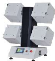
Icl Pilling Tester Model :As per Sample