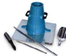
SCC-Slump Cone Test Sets Model: as per sample