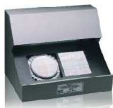
Pilling Assessment Viewer Model : As per sample