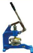
Hydraulic- GSM-Cutter Model : CU- 268 china