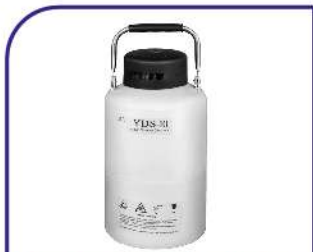
Liquid nitrogen Container Model: LNG-2-30 to LNC-6.50