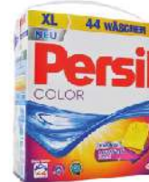
Persil-Color-Pulver-4.55kg Model : Henkel-Germany