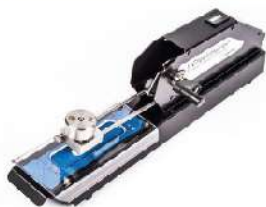
Crock Meter Model : James Heal