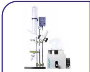
Rotary Evaporator Model : RE-201D, RE-301, RE-501