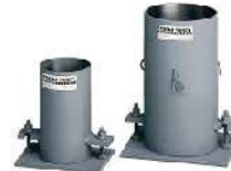
Cylinder Mould Model : as per sample