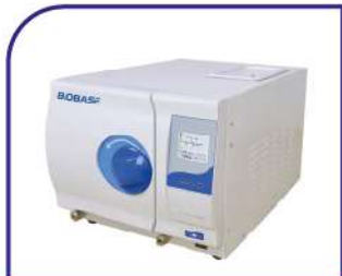
Table Top Autoclave Model: BKM Z188