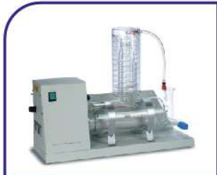
Glass Distill Water Plant Model : EW 99295-OX