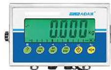
Adam RE Indicators Model : AE 402