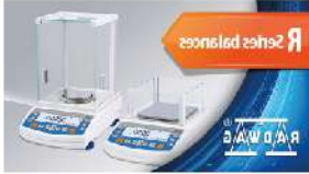
Digital Balance Model : RADWAG Poland