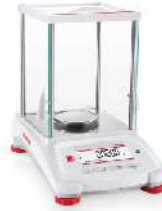
Analytical-Balance Model : Ohaus-PR224-E, USA