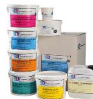
SDC ECE Phosphate Reference Model : As per Sample