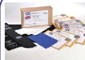
Blue Wool & Humidity Test Materials Model : As per Sample