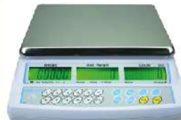
CBC Bench Counting Scales Model : CBC 32