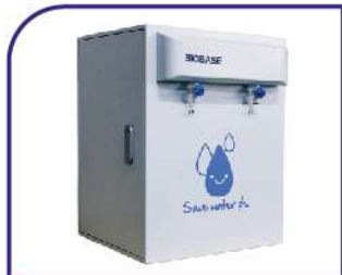
Water Purifier Model: SCSj-1