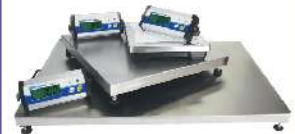
CPWPlus Weighing Model : CPWPlus 300L