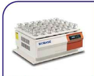
Shaker Model : SK-300DM SK-311TD, SK-322D