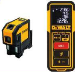
Laser Distance Measures Model : as per sample