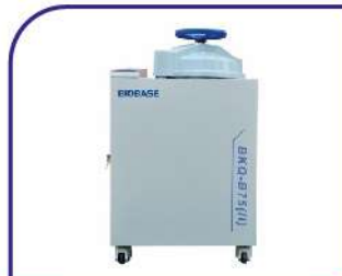
Handwheel Vertical Autoclave Model : BKQ B50