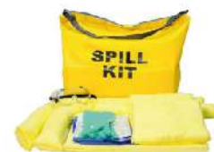
Universal-Chemical-Spill-kit Model : 45-Ltr Fuel-Chemical-Add