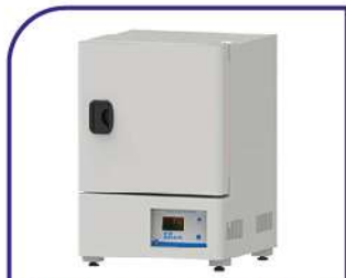
Digisystem-Digital-Hot-Air-Oven Model : DSO-300D Taiwan