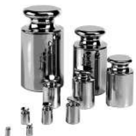
OIML Weights Model: E2 1mg-200g, F1 1g-500g, M1 1g-2kg