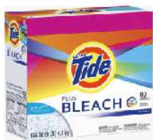
Tide-Plus-Bleach-Detergent Model : Powder-4.10kg-pg-USA-