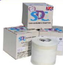
Multifiber DW Model :As per Sample