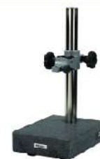
Mitutoyo 6-inch Clip Model : Mitutoyo 500-196-30 AOS