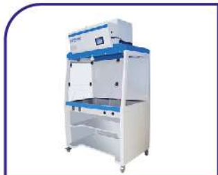
Ductless Fume Hood Model: FH-1000 (C)