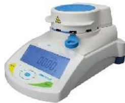
PMB (Moisture Analyser) Model : PMB 53, PMB 202