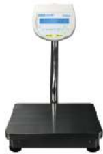
Precision Balance Model : NBL 4602i