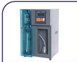
Kjeldahl Nitrogen Analyzer Model : BKQ B50