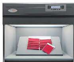
Verivide Light box Model : As per Sample