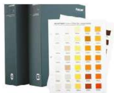
Coton Panner (TCX) Model : As per Sample