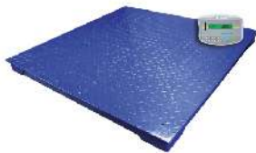
PT Platforms Model : PT 315