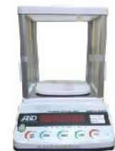
Precision-Weight-Balance Model : AND-FGH