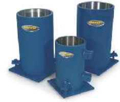
Concrete Steel Cylinder Mold Model: As Per sample