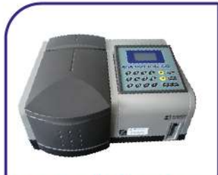
Spectrophotometer Model : UV-T60, T70, T80+