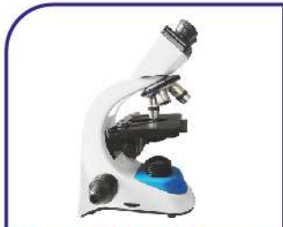
Laboratory Biological Microscope Model: Xs-208A, xs-208BAP HD