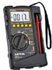
Sanwa Digital Multimeter Model: CD800A