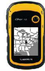
Garmin GPS Model : Garmin