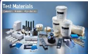
Test Materials Model : James Heal