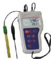
Multi-Parameter-Splash-Proof-pH-ORP-Temp-Portable Model : AD130 Romania