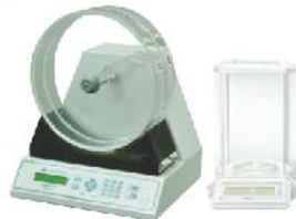
Dual Drum Friability Tester Model: WT 111, 902, 903