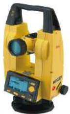
Opti-Cal Survey equipment theodolite Model: leica-builder-100