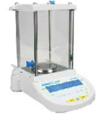
Analytical-Balance Model : AS220, R2 Plus RADWAG Poland