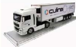
Truck Scale Model :