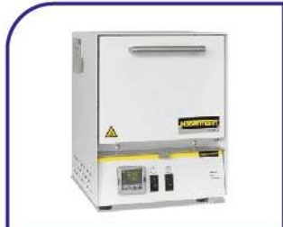
Muffle Furnace Model : LE1, 11, R7