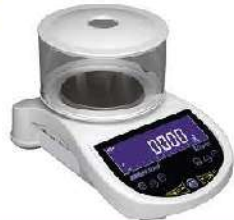
adam equipment Model : EBL 223e