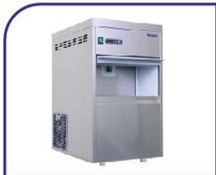
Ice Maker Model : FIM50