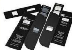
SDCE Grey Scale Model : As per Sample